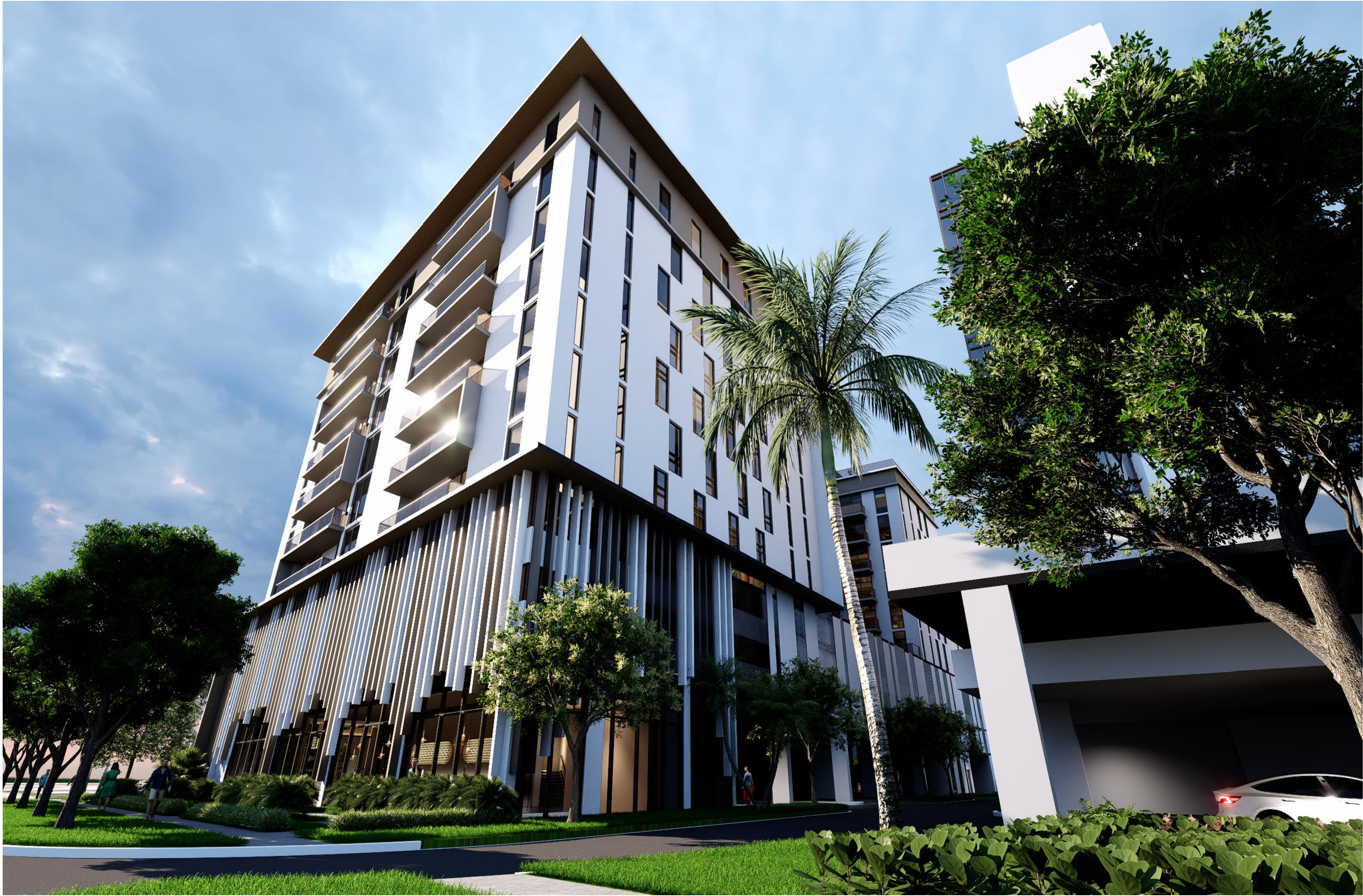
STREET VIEW OF THE SOUTH WEST CORNER OF THE BUILDING